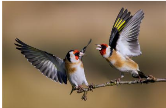
Goldfinches by Edmond Fellowes, Dumfries CC, SPF