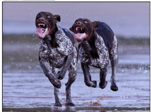
German Retrievers