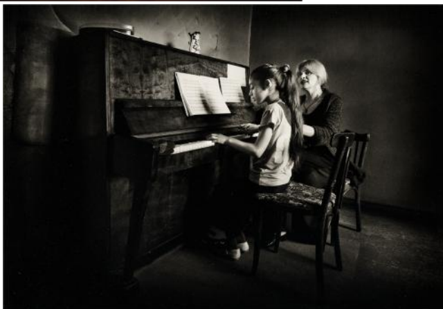
Piano Lesson