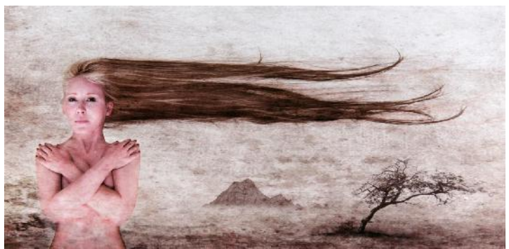
East Wind by Jill Baxter, Tenby CC, WPF