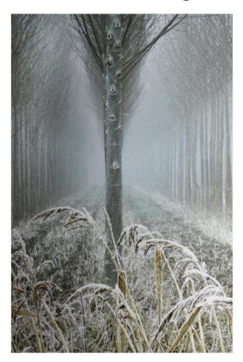
Poplars & Reeds, Irene Froy, Wrekin Arts PC