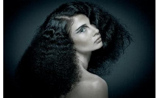
YOU CAN SEE THE EXHIBITION AT THE GOSPORT GALLERY 1<sup>ST</sup> TO 23<sup>RD</sup> JULY 10am – 4pm MON – SAT. A LIST OF FURTHER VENUES WILL BE PUBLISHED IN A FUTURE ISSUE OF E-NEWS.